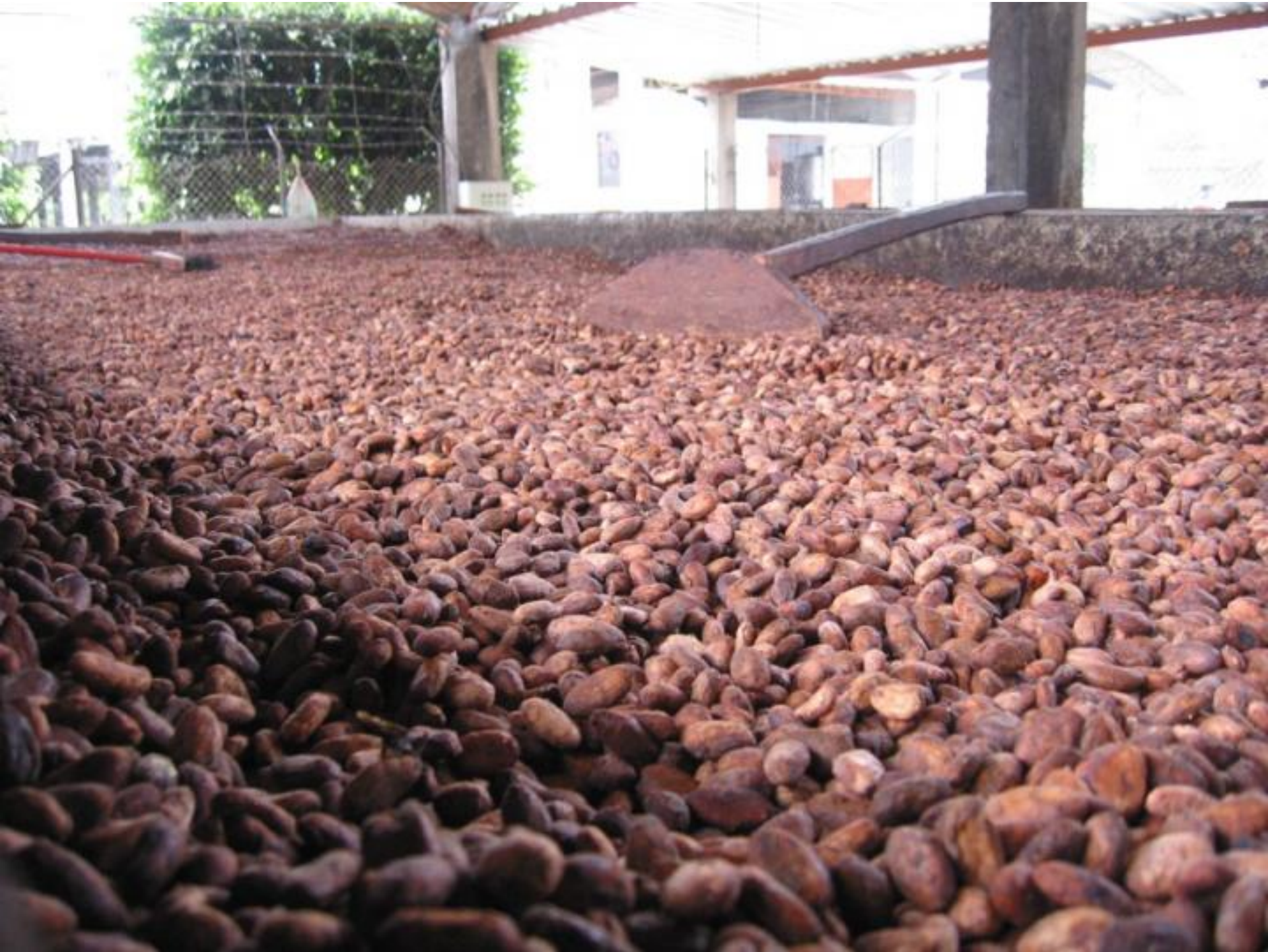
IMAGE: CACAO SEEDS AFTER HARVEST. A MIXTURE OF LIPIDS CALLED COCOA BUTTER MAKES UP ABOUT HALF OF EACH SEED. THE NATURAL MELTING POINT OF COCOA BUTTER IS CLOSE TO HUMAN BODY... view more >